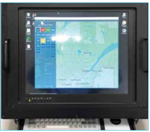
Upgraded PPI Display

Legacy displays will be replaced with our new touchscreen LCDs to deliver significant usability enhancements, including software that provides superior tactical interfaces for operators. All tracked and untracked videos are output from the video processor as ASTERIX Ethernet signals in CAT-240. The additional capabilities added to the AN/TPS-75 signal and post-processing functions include ADS-B data incorporated and available at the output and on the display. Legacy maintenance display functions can optionally be integrated into and handled by the TSS PPI display. A 3D Tracker is also an available option.